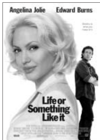
In About a Boy , rated PG13, filmdom's cutest cad chain-smokes around a 12-year-old boy he's mentoring. Another recent PG13, Life or Something Like It , paired Angelina Jolie with Camels. Hollywood began to introduce smoking into more kid-rated movies after Congress pressed the industry to keep more teens out of movies rated R.

Only two industries in America act as if pushing poison to kids is a legitimate business.