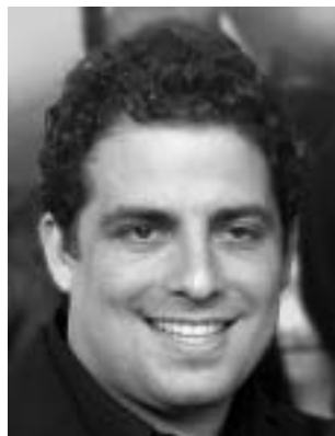
Brett Ratner made Hoya de Monterrey cigars family fare.

While legal limits on tobacco promos to the young got tougher in other media, tobacco incidents in kid-rated movies jumped 300% last year. Coincidence?