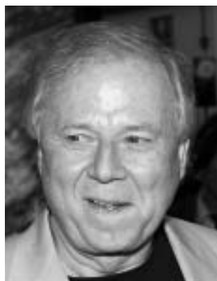
Wolfgang Petersen used Marlboros to smoke up a storm.

With tobacco ads banned on TV and billboards, and magazine promotion to youth now restricted, Hollywood movies have become one of last major channels for promoting tobacco to young people both in the