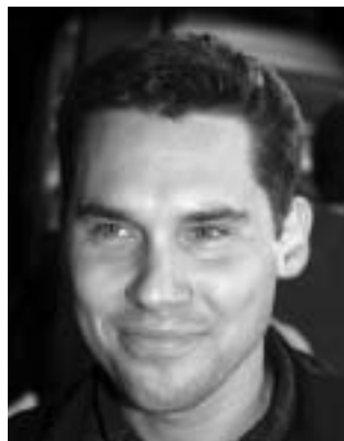
Bryan Singer's heavy-smoking X-Men comic was rated PG13.