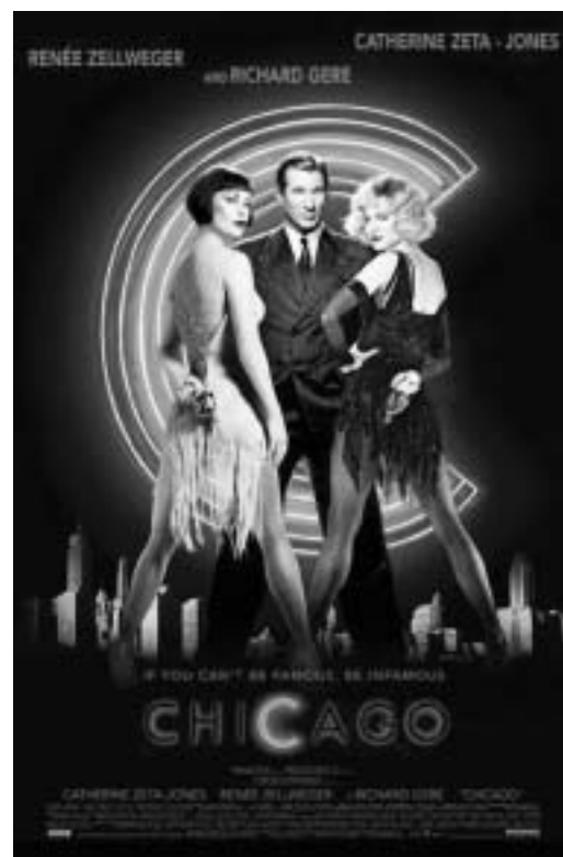
DIE ANOTHER DAY (MGM/UA), CHICAGO (Miramax), and THE EMPEROR'S CLUB (Fine Line) are just three recent smoking movies rated PG13. The smoking is meant to be noticed or it wouldn't be there. The movies are meant to be seen by young teens or they wouldn't be PG13.

theater owners cracked down on underage teens seeing R-rated films, smoking just followed the target audience. Four out of five PG13 movies now promote smoking.